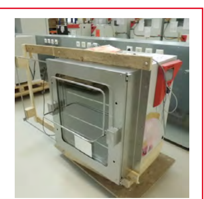
> 2. Modified CB 160 incubator

Customer contact: Sysmex Suisse AG Tödistrasse 50 CH-8810 Horgen