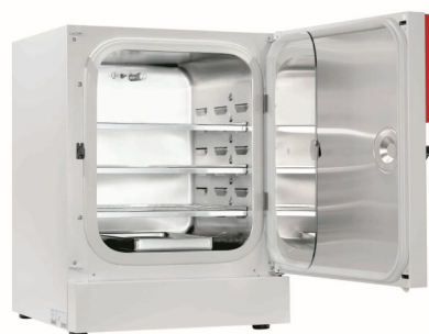
▲ CO 2 -incubator CB 150